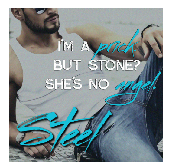
Steel - I'm a prick. But Stone? she's no angel.

Read Stone and Steel's second chance romance in the 4th instalment of the Dark and Dirty Sinners' MC Series.