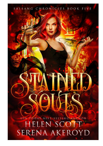
Stained Souls - Book 5 in the Salsang Chronicles

Start the series here: www.books2read.com/StainedEgos