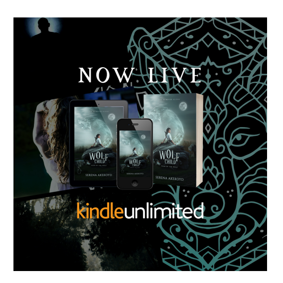
Wolf Child is live and free to read on KU.

Amazon Worldwide: https://books2read.com/steelserenaakeroyd/Add to your TBR on Goodreads: https://bit.ly/SteelGRTBR