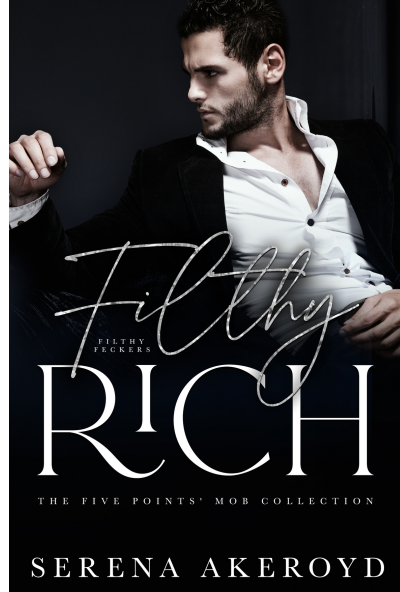
Filthy Rich - Book Two in the Five Points Collection and Book One in the Filthy Feckers Series