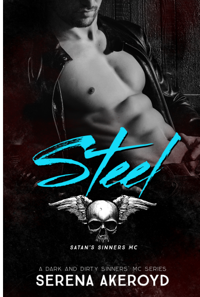
Steel - Book 4 in the Dark and Dirty Sinners' MC Series