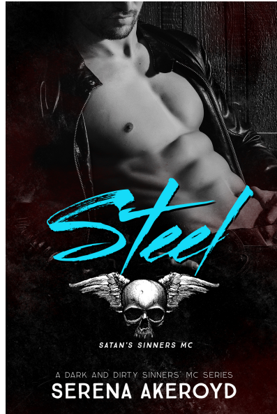
Steel - Book 4 in the Dark and Dirty Sinners' MC Series