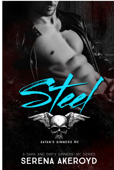
Steel - Book 4 in the Dark and Dirty Sinners' MC Series