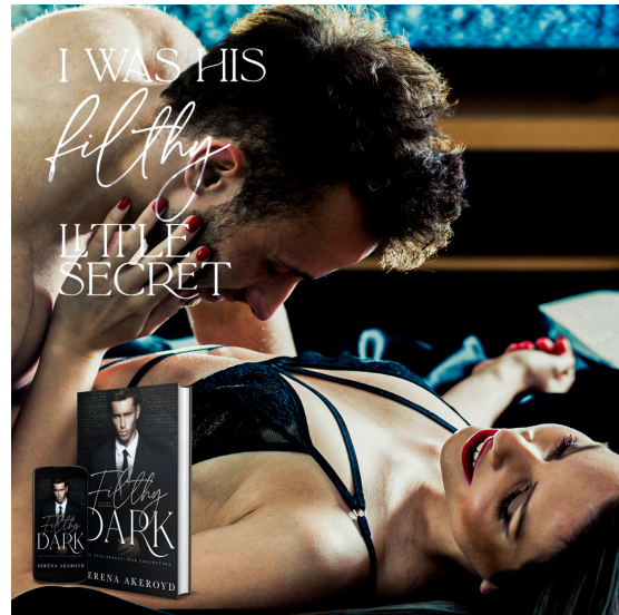
I was his filthy little secret.

This story is gritty and sexy and intense. It gave me a book hangover writing it! LOL So bring a fan and tissues! ;) Mostly, though, just get ready to dive in!!! As with all my