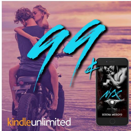
Nyx for 99 cents!