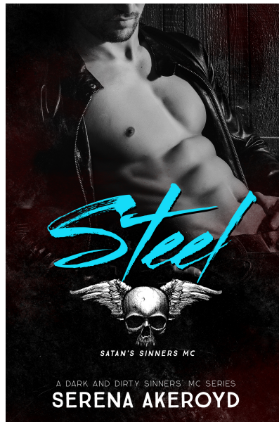
Steel - Book 4 in the Dark and Dirty Sinners' MC Series