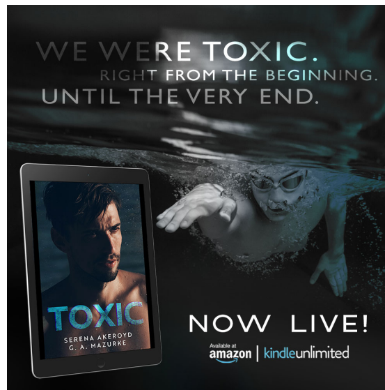
TOXIC for 99 cents!