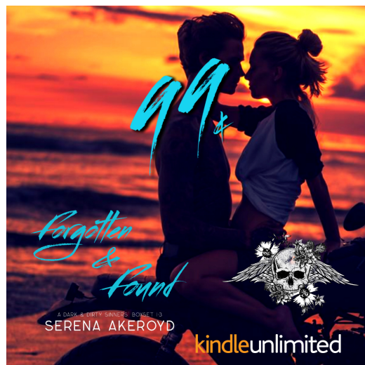
Forgotten and Found for 99 cents!

FORGOTTEN AND FOUND, FILTHY and TOXIC on sale for 99 CENTS each!!!