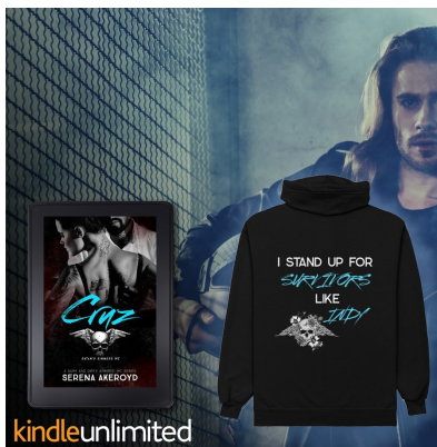
I stand up for survivors like Indy