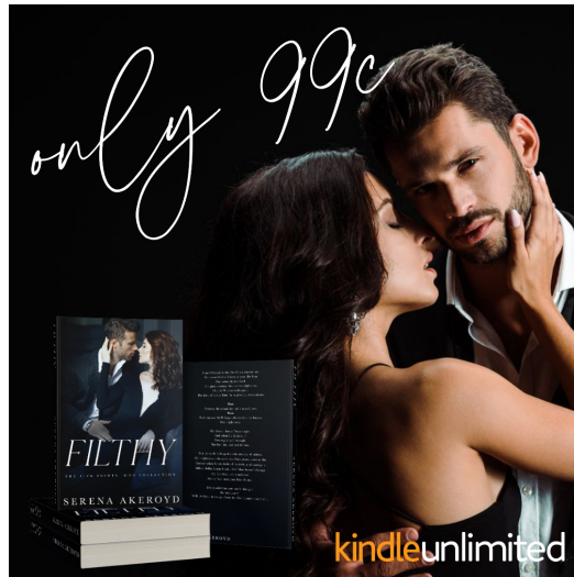
Filthy for 99 cents!