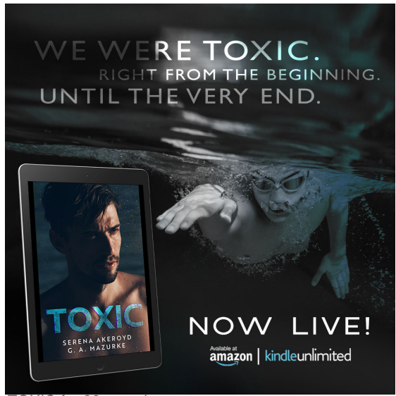
TOXIC for 99 cents!