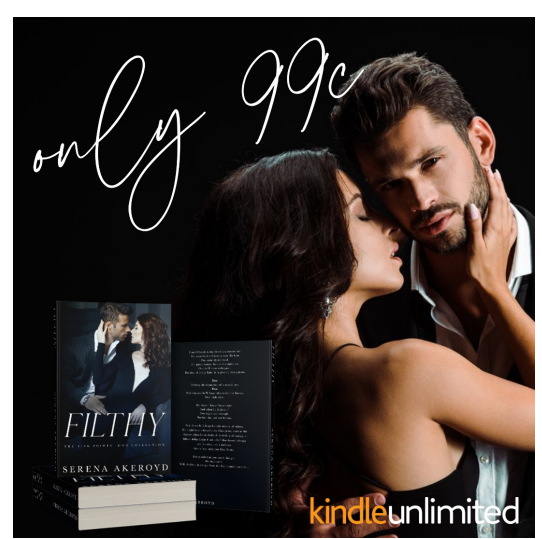
Filthy for 99 cents!