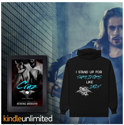
I stand up for survivors like Indy

FORGOTTEN AND FOUND, FILTHY and TOXIC on sale for 99 CENTS each!!!