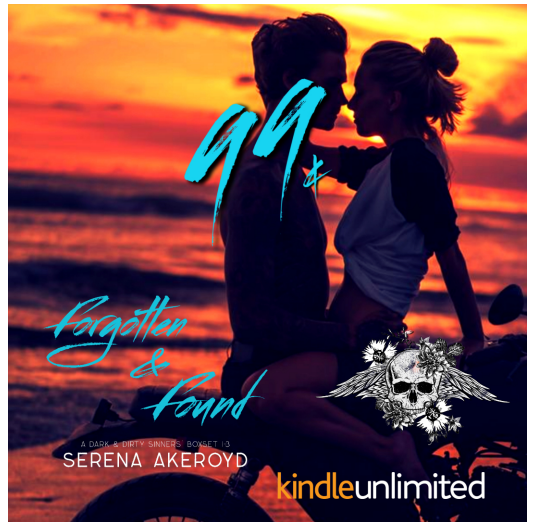
Forgotten and Found for 99 cents!