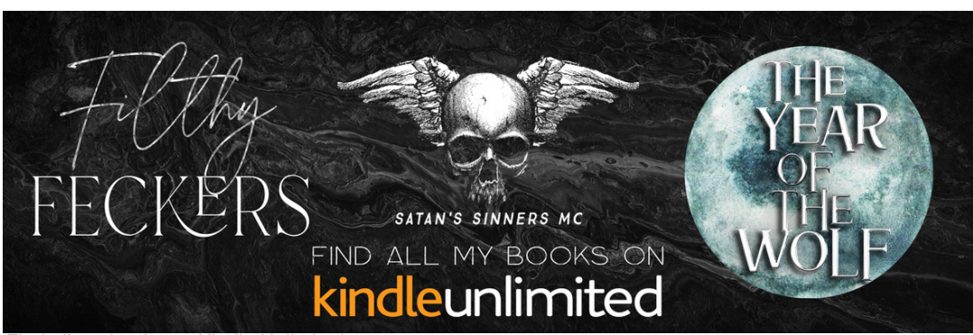
Find all my books on Kindle Unlimited