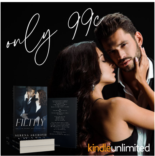
Filthy for 99 cents!