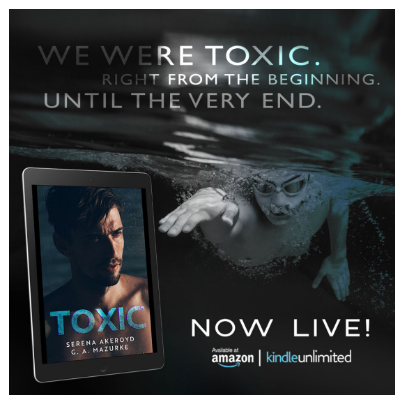
TOXIC for 99 cents!