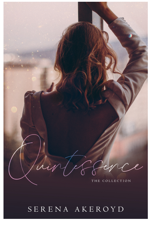
Quintessence : The Collection

I will be putting Hers To Keep , Theirs To Cherish and Hers To Hold in one big ebook! And I will be adding all the extra content that I had previously posted on my reader group, plus close to 10K words of new content!