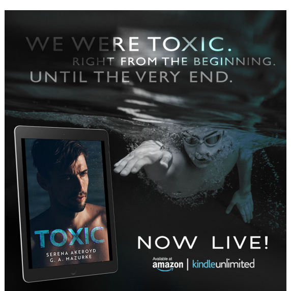
TOXIC for 99 cents!