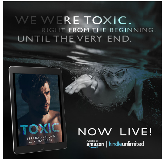
TOXIC on sale for 99 cents!