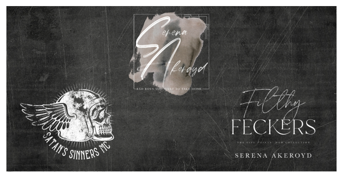
Find all my books on Kindle Unlimited

For the inside scoop, giveaways, and sneak peeks at what's coming up next!