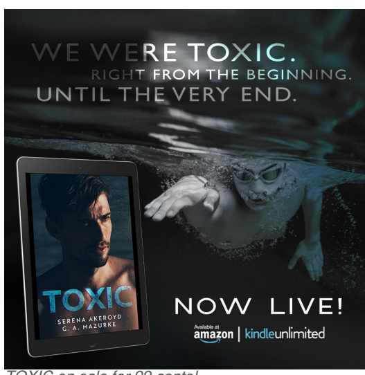
TOXIC on sale for 99 cents!