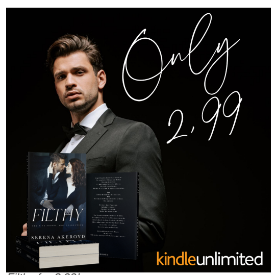
Filthy for 2,99!