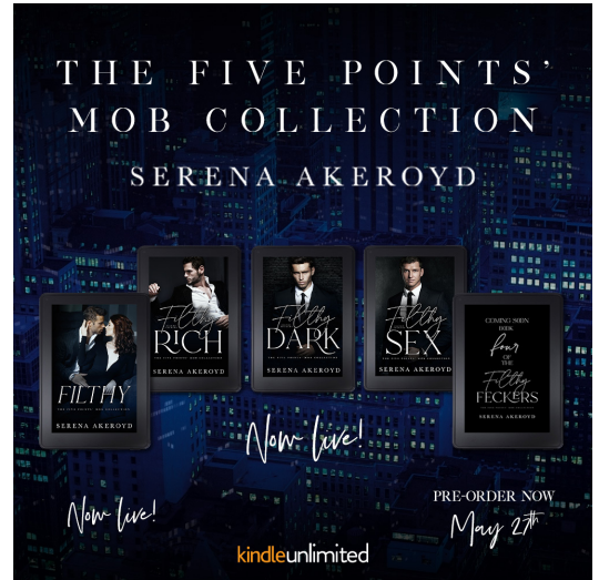
PreOrder Filthy Hot TODAY!