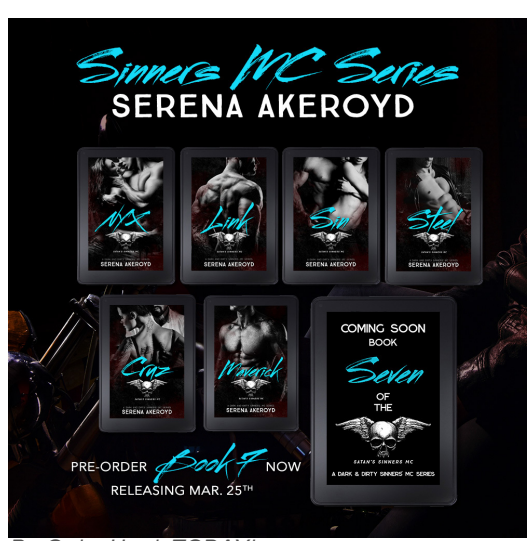
PreOrder Hawk TODAY!